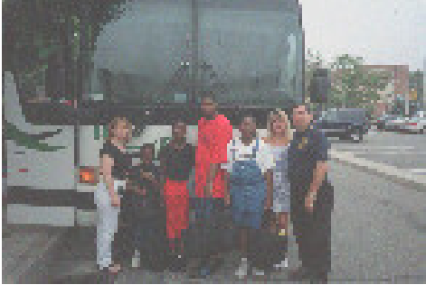
Franklin Square Kiwanians and Kampers

The club is looking forward to breaking bread with the rest of the division at their annual Pasta Night, which will be held on