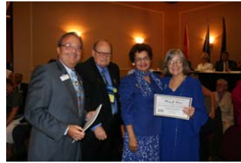
Mary Burns is installed as the next Lieutenant Governor.

held at the Mirage Nightclub, which is located at 737 Merrick Avenue in Westbury. Restaurants, Bakeries, and Confectioners in the East Meadow area prepare the food, and those who come get to sample the tempting treats. The eating will take place from 6:00 pm - 9:30 PM.