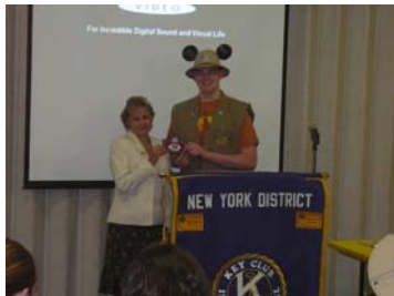
In the Spotlight 4 Sight

I would like to thank all of you for all of your help and encouragement over the past year. It has been both a pleasure and an honor to work with you, and I wish you and your families all of the best.