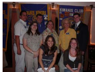
It's on to Wisdom Lane.

Our goal is to raise $10,000.00 for the Foundation Fighting Blindness through several pre-show fundraising events, selling of Spotlight 4 Sight label pins, selling program ads, act registrations, sponsorships and, ticket sales.